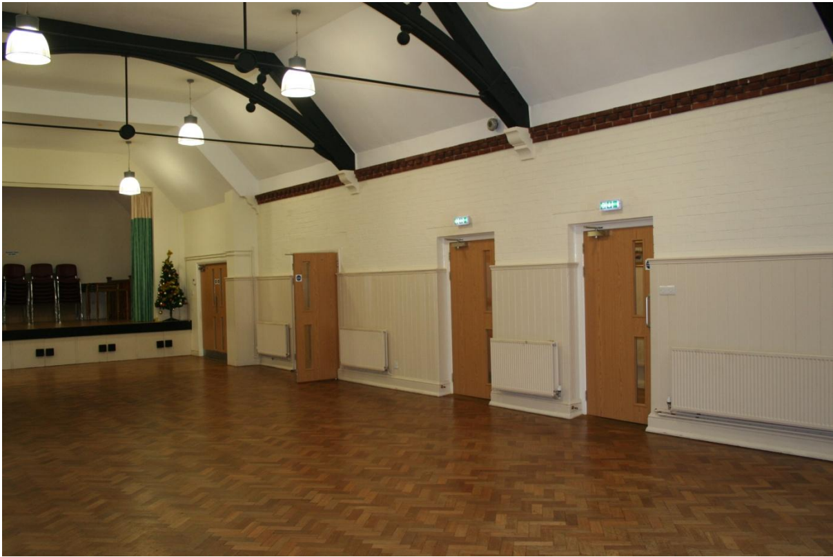
East side of Large Hall