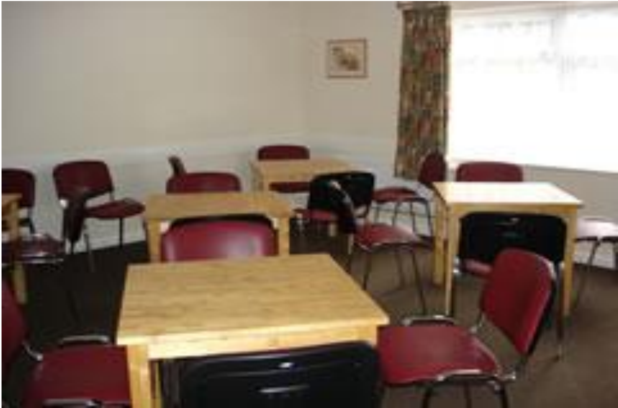
Small Hall tables set for Coffee or Cards