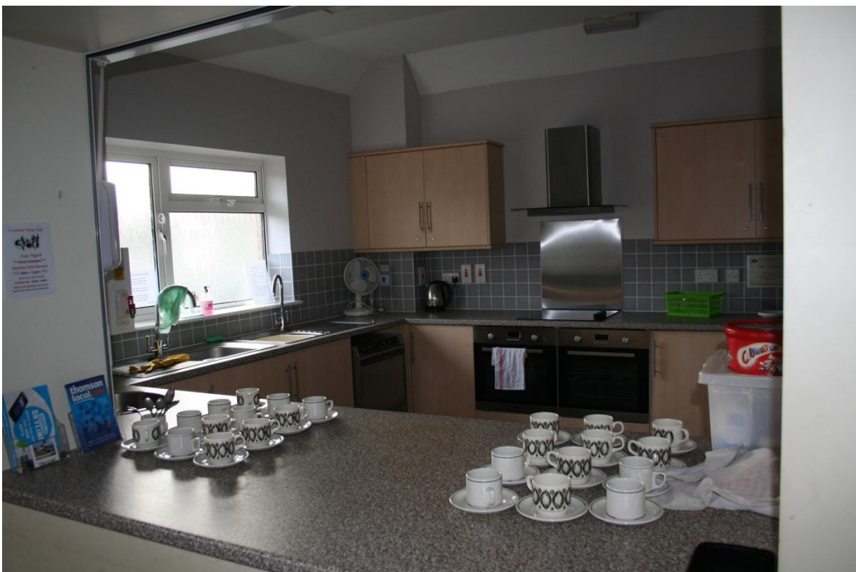
Kitchen viewed through hatch from small hall

The kitchen provides two small ovens, a small refrigerator and a 2 minute cycle commercial dishwasher plus two deep sinks, a small sink for washing hands, all with hot and cold water and a water boiler.