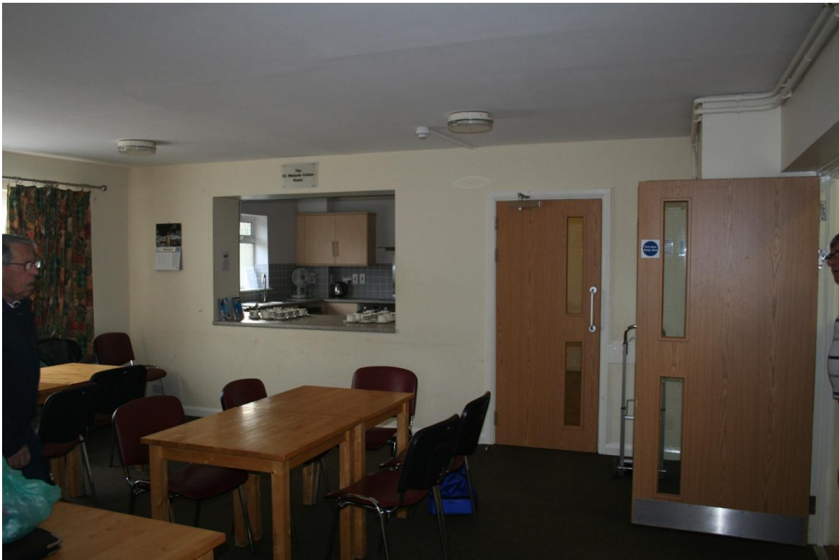
Small Hall towards Hatch with tables set for Coffee

The Small Hall measures 5.5m x 5.5m( 18ft X 18ft), adjoins the Large Hall through a double door, is carpeted and used mainly as a meeting room or, combined with the Large Hall for serving refreshments or providing children's entertainment.