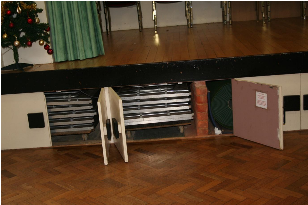
Storage for Folding Tables and Bowls Mats Beneath Stage

The Large Hall measures 17m x 7m (55ft x 22ft) with a teak, wood block parquet floor and stage. This is ideal for functions, such as dancing, concerts, classes and parties.