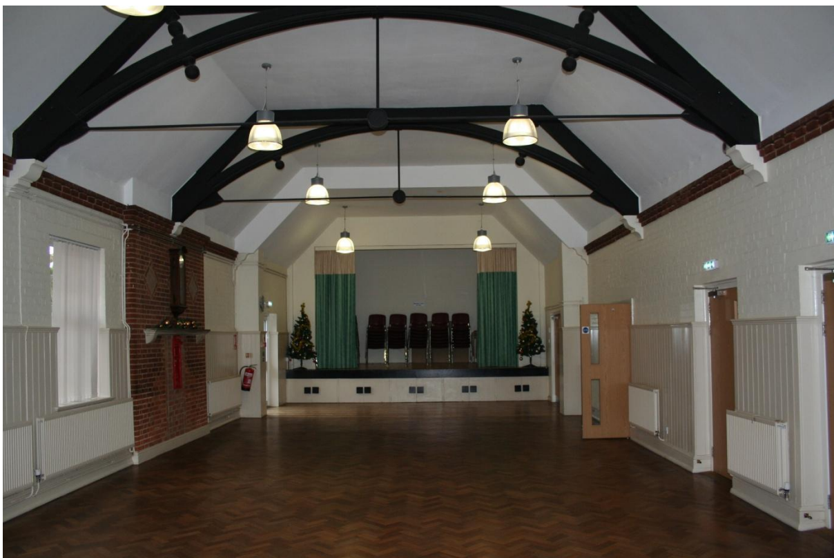
Large Hall towards Stage