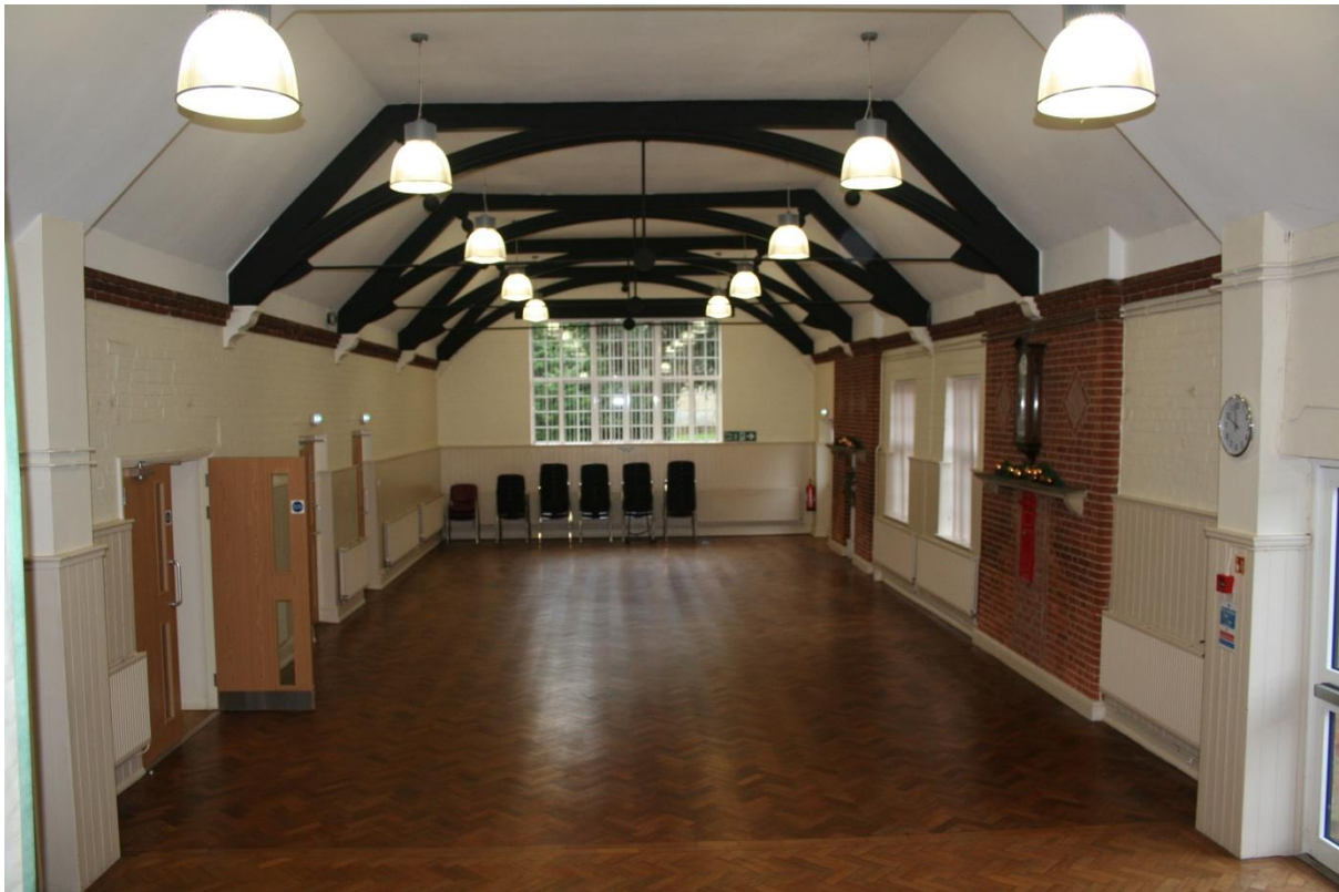
Large Hall from Stage