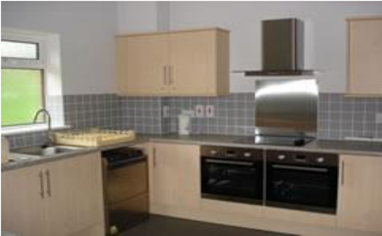
Kitchen - large sink, dishwasher, two ovens and hob + integrated refrigerator.