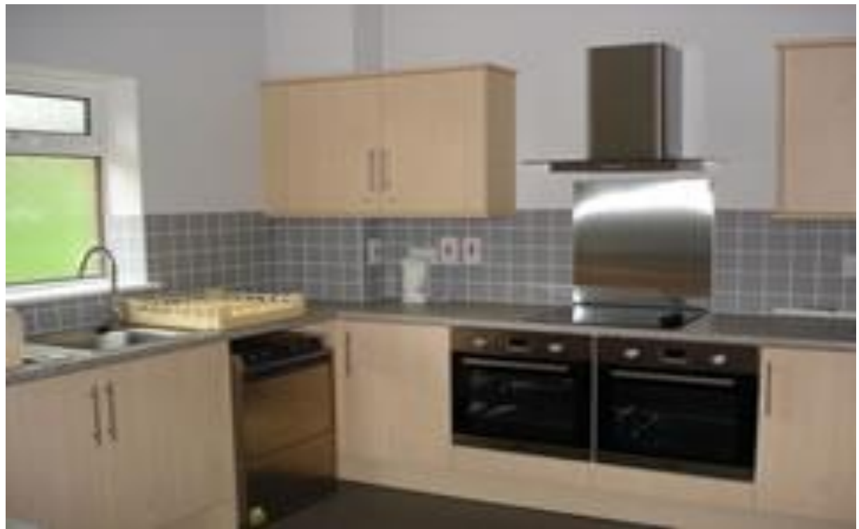
Kitchen - large sink, dishwasher, two ovens and hob + integrated refrigerator.