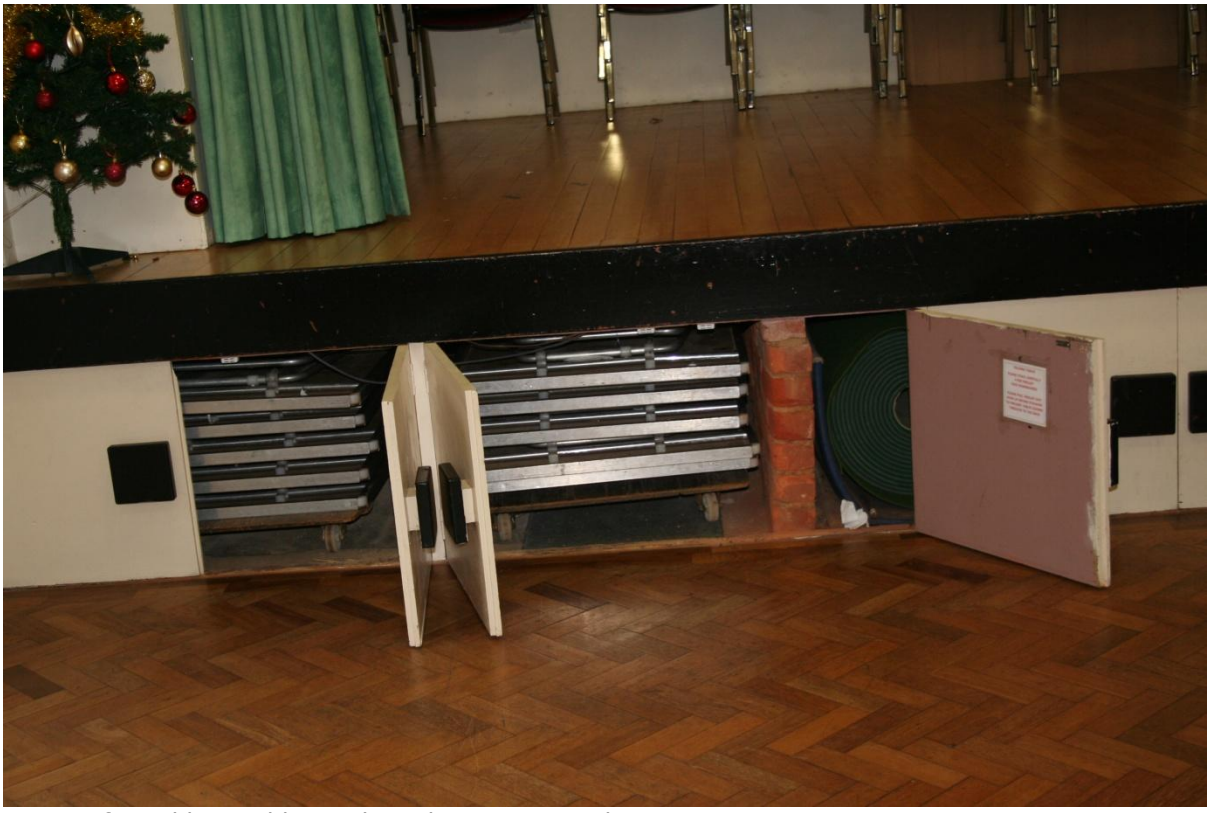
Storage for Folding Tables and Bowls Mats Beneath Stage

The Large Hall measures 17m \times 7m (55ft x 22ft) with a teak, wood block parquet floor and stage. This is ideal for functions, such as dancing, concerts, classes and parties.