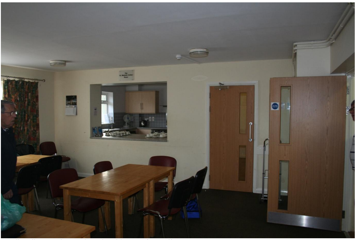
Small Hall towards Hatch with tables set for Coffee

The Small Hall measures 5.5m \times 5.5m(18 ft \times 18 ft), adjoins the Large Hall through a double door, is carpeted and used mainly as a meeting room or, combined with the Large Hall for serving refreshments or providing children's entertainment.