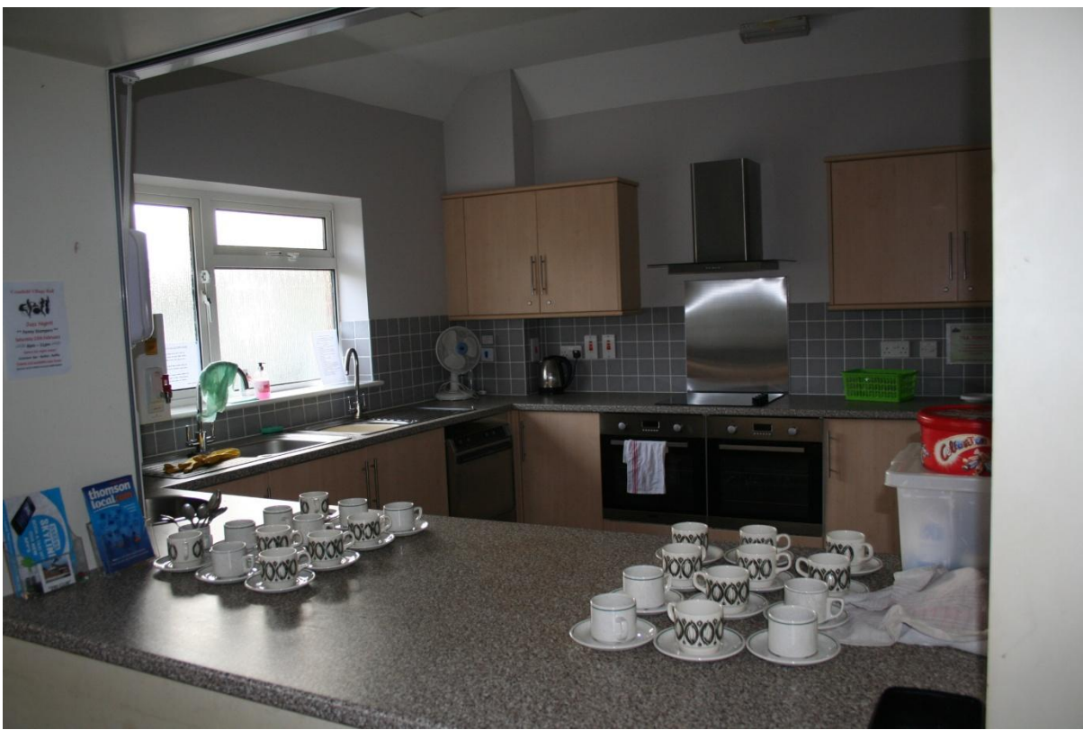
Kitchen viewed through hatch from small hall

The kitchen provides two small ovens, a small refrigerator and a 2 minute cycle commercial dishwasher plus two deep sinks, a small sink for washing hands, all with hot and cold water and a water boiler.