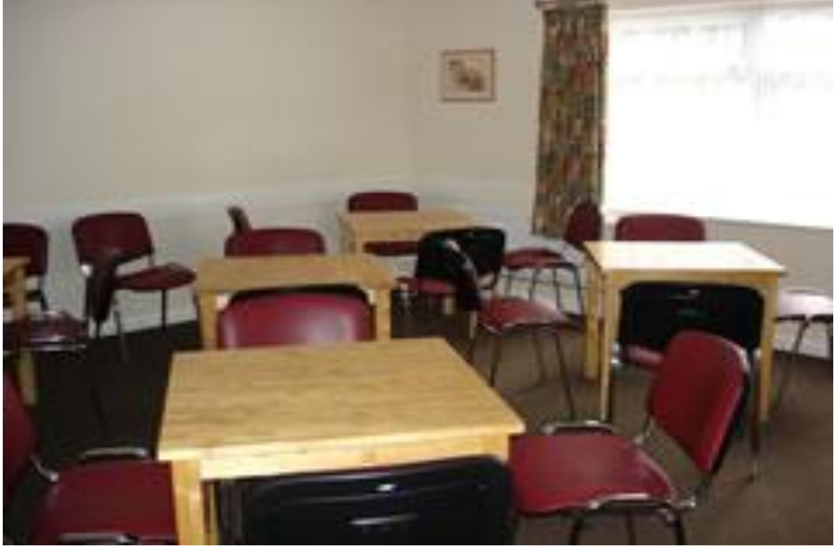
Small Hall tables set for Coffee or Cards