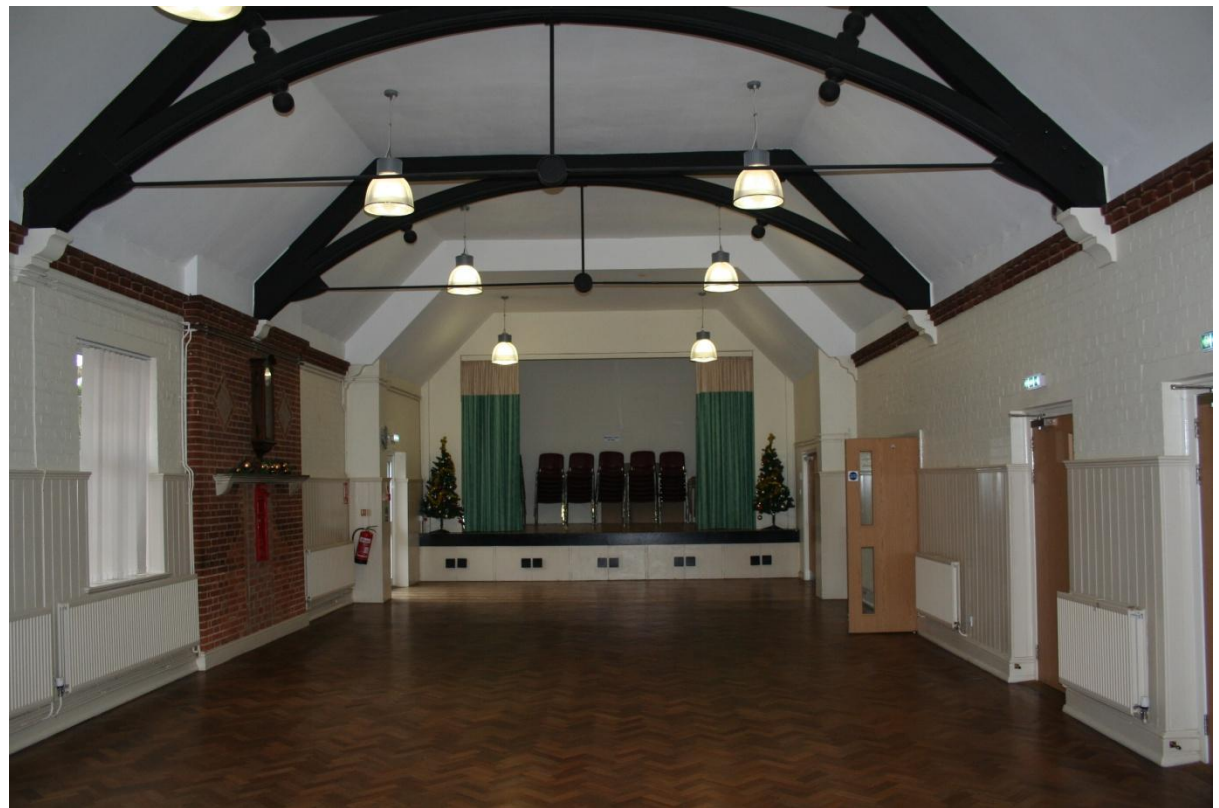
Large Hall towards Stage